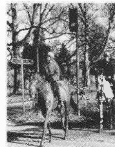
When considering a crossing for equestrians, cyclists and/or pedestrians, then the general references to pedestrians in this document can be read to include all groups. However, only pedestrians may use pedestrian crossings.