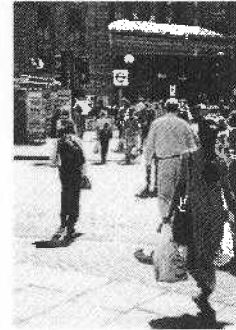
Pedestrian crossing facilities at traffic signal controlled junctions are covered in TA15 (1) .